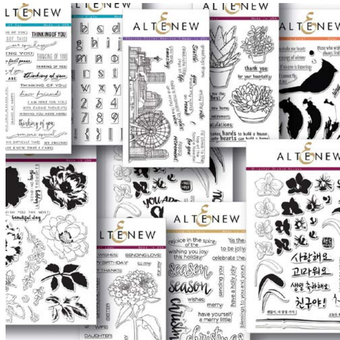
10 new stamps!