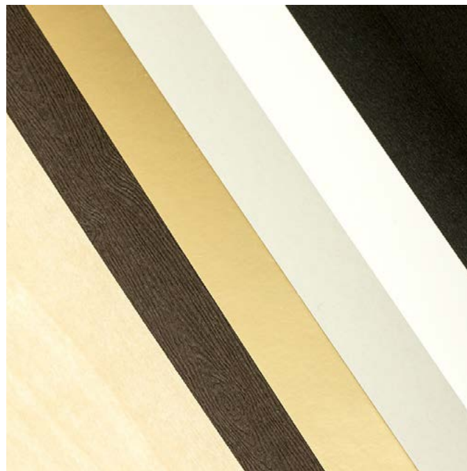
6 New Paper!